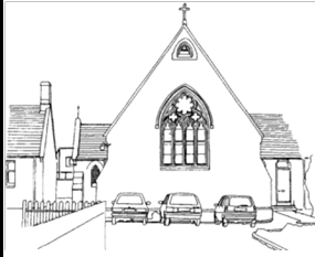
Our Lady & St John's Carlisle Road Blackwood, ML11 9RZ