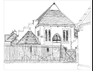
St Mary's Raploch Road Larkhall, ML9 1AN